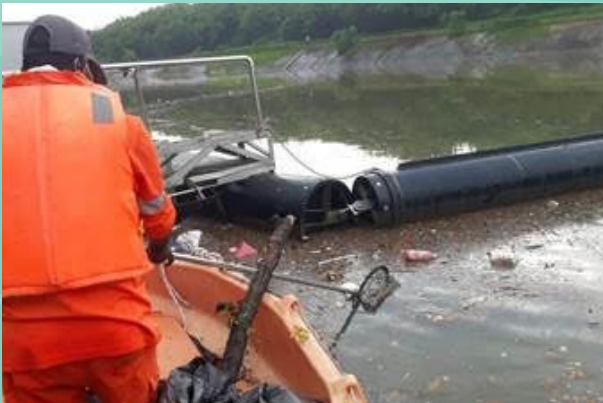
Cleaning at litter trap

Singapore has a range of waterway clean-up measures that prevent litter or plastic waste, regardless of source, from being washed into the ocean. Litter that enters our waterways is caught by litter traps installed at appropriate locations and expediently removed by flotsam removal craft. In addition, marine litter that washes onto our recreational beaches and coastlines are removed by NEA and other government agencies, regardless of litter sources. NEA also cleans the recreational beaches and coastlines under its purview regularly with frequencies ranging from four times a week to once in two weeks, depending on public usage and accessibility to the beach.