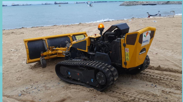
Robocut remote control beach cleaning machine