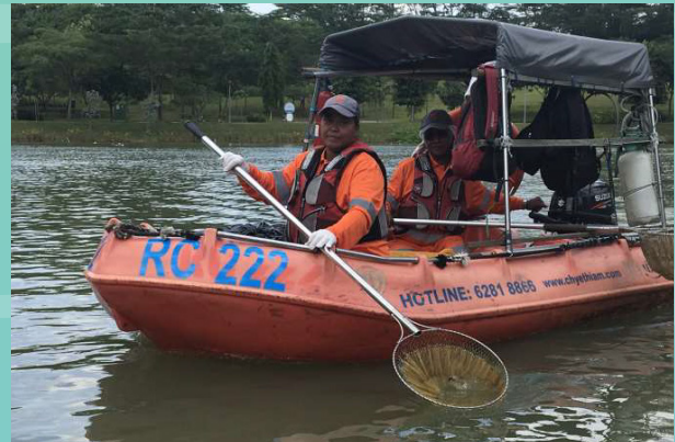
Flotsam removal craft