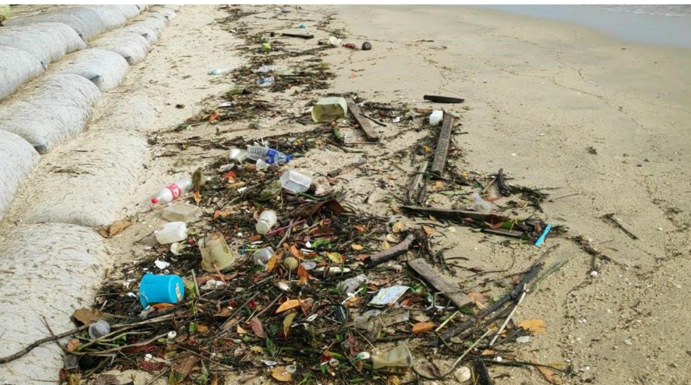
Marine litter on the beach

As a responsible global citizen, Singapore recognises our role in contributing to the collective response to tackling marine litter and microplastics. This National Action Strategy aims to summarise and outline Singapore's various actions and measures to combat the issue of marine litter.