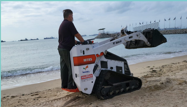
Bobcat beach cleaning machine