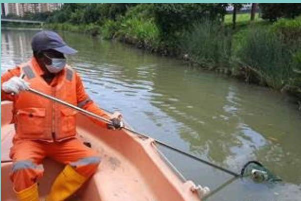
Cleaning of waterway