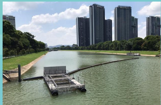
Litter trap at waterway