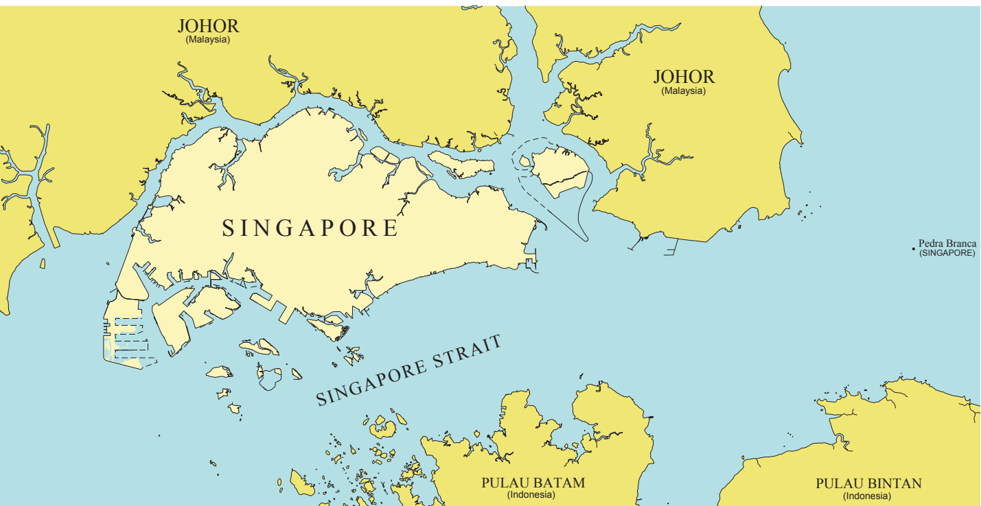
Map of Singapore

Pacific regions 8 – and additionally sits near the Coral Triangle. While Singapore is one of the smallest countries in the world with a total land area of 728 square kilometres (as of 2020) and a 511-kilometre coastline, our waters and coastline harbour relatively rich marine biodiversity. They are home to 12 of the 23 species of Indo-Pacific seagrass, 31 true mangrove plant species (two-thirds of that in Asia), over 250 species of hard corals (a quarter of the world's 800 species), over 200 species of sponges, over 60 species of echinoderms, over 50 species of sea anemones and many other species of marine plants and animals.