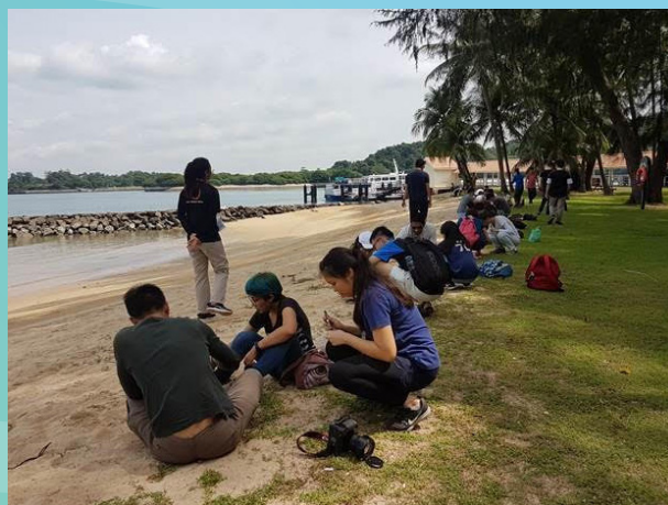
Citizens involved in sampling activities for the NUS-NParks Marine Debris Study

To build on current knowledge of the marine litter situation in Singapore, and in coordination with the NUS-NParks Marine Debris Study, NEA has embarked on a Marine Litter and Microplastics Consultancy Study, to provide a better understanding of the levels and pathways of marine litter and microplastics in Singapore's inland waterways, coastal waters, and recreational beaches.