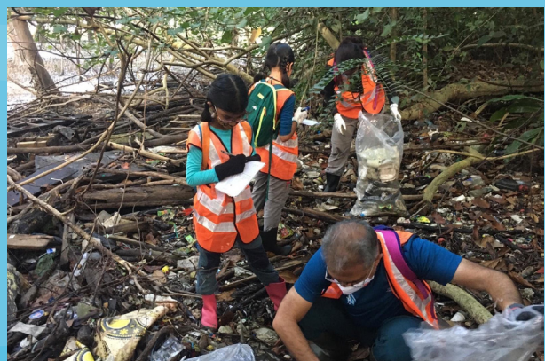
Citizens collecting litter and helping with data collection in community clean up initiatives