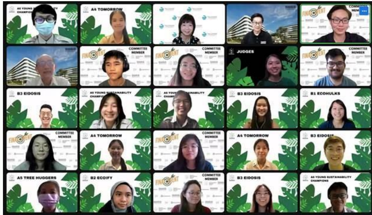
SMS Khor (top row-centre) with the finalists and organisers of the Sustainable Design Hack 2022