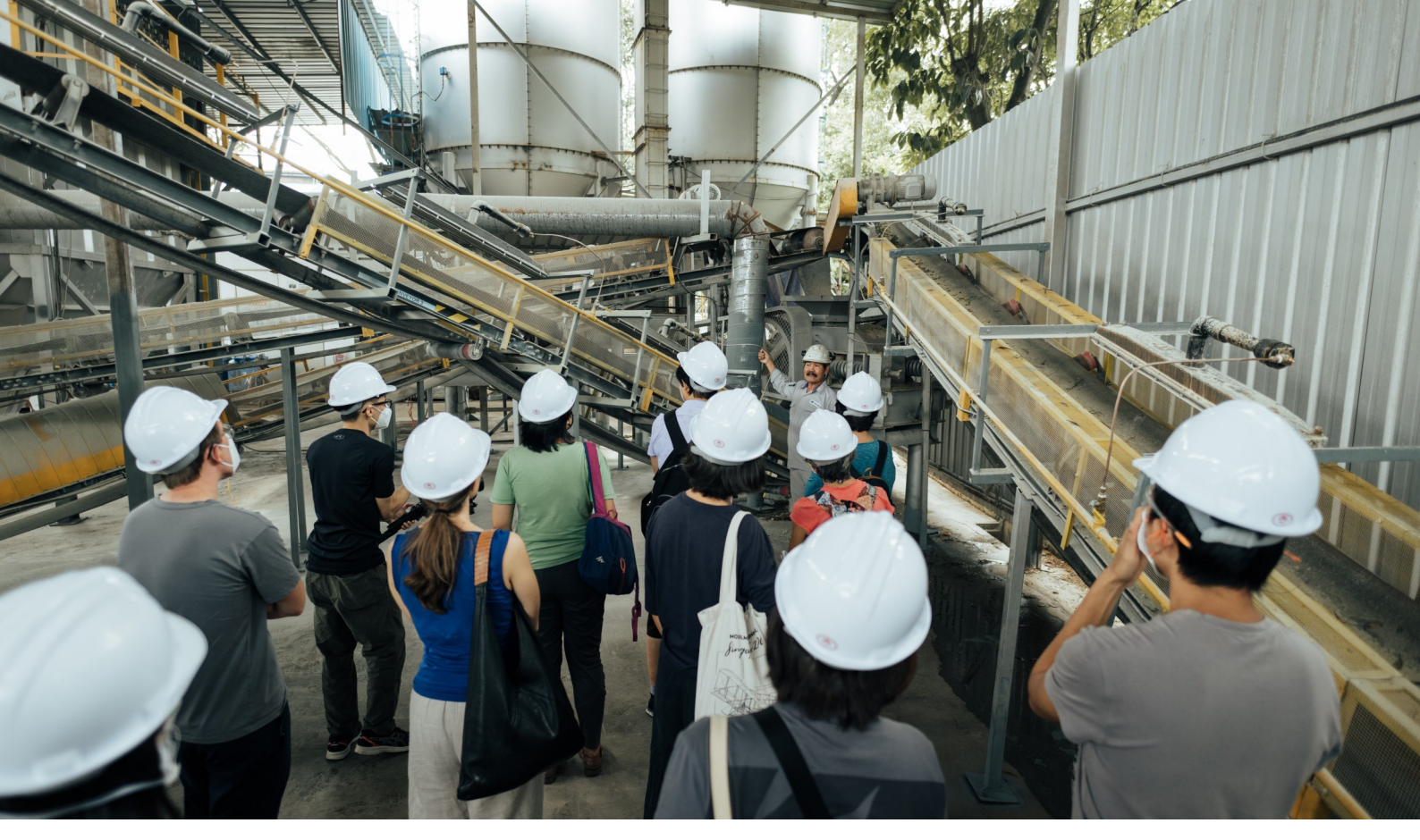
Visitors to Abraclean's glass recycling facility learnt about how Abraclean converts trash to treasure.