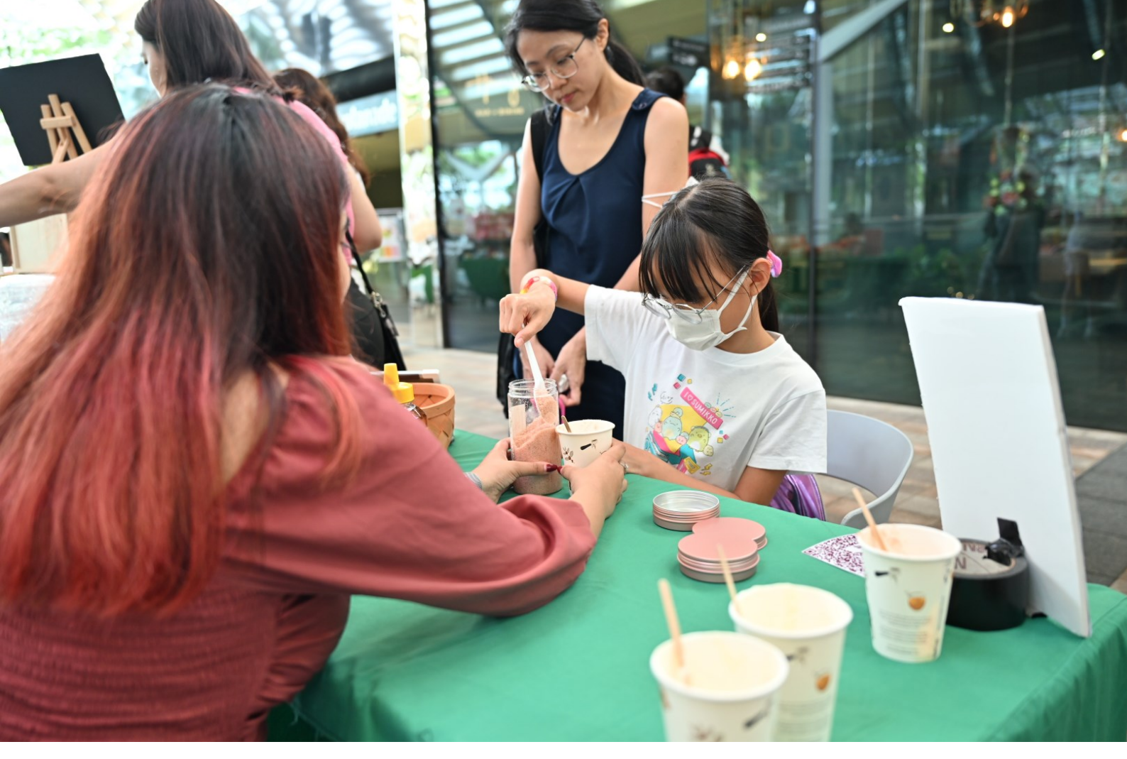
A participant making her own body scrub at the Green Glam Up! workshop organised by City Sprouts.