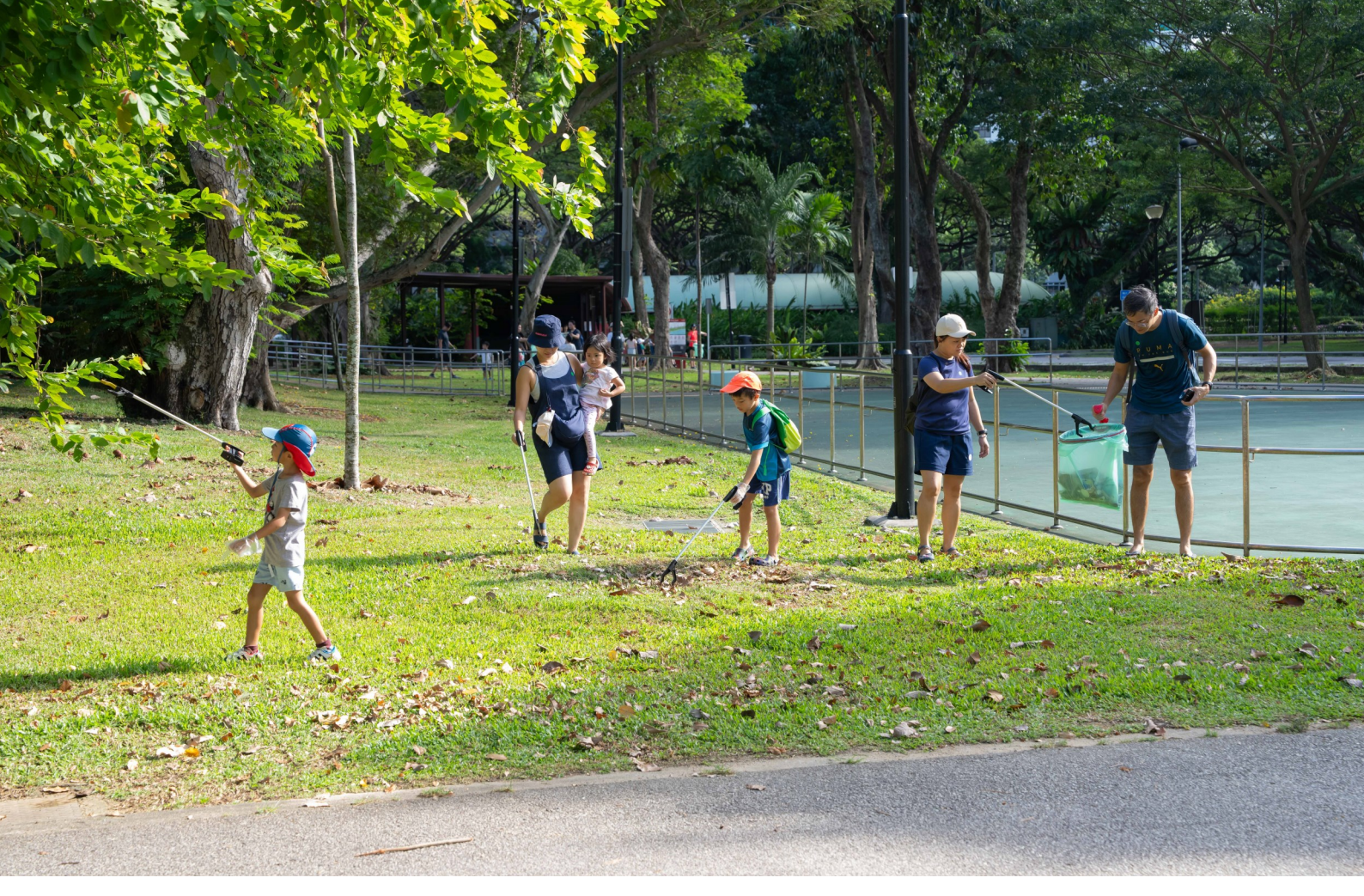
Participants at a beach and urban clean-up, organised by Just Keep Thinking and Stridy.