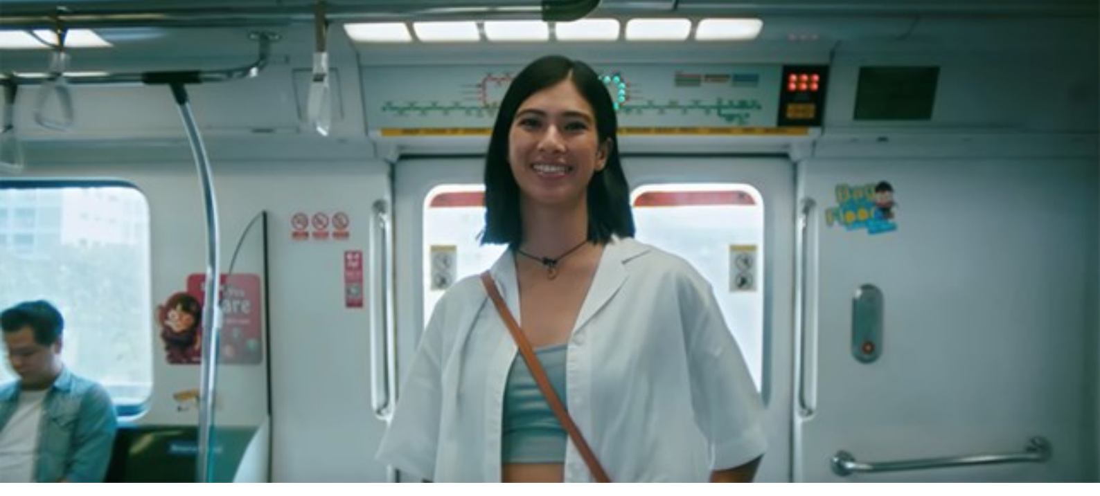
Screengrab of the Go Green SG brand film 'Go Green Your Way'