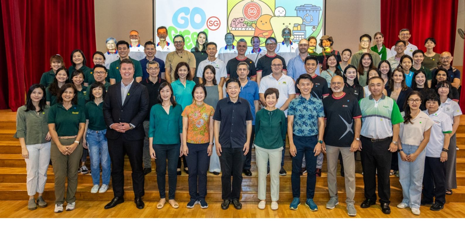
Deputy Prime Minister Lawrence Wong and partners at the launch of Go Green SG 2023.