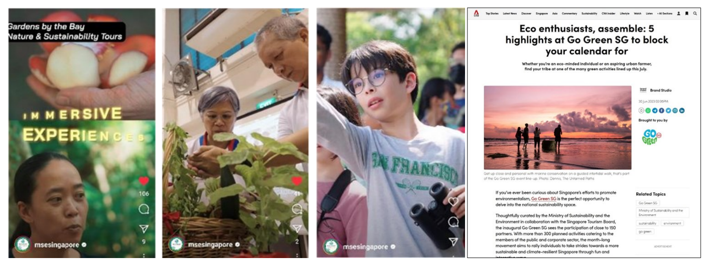
Samples of publicity featuring various Go Green SG 2023 activities.

Publicity channels that MSE are considering this year include radio, out-of-home advertisements such as placements in trains and train stations, digital platforms such as website banners, advertorials, search engine marketing to drive traffic to the Go Green SG website, and social media channels. Influencers will also be invited to attend selected activities and create reels to promote the Go Green SG activities on social media.